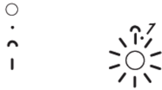
Katze - HS 2